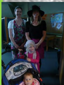
Off to a High Tea....